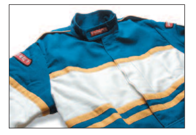
Racing Suits See pages 10 – 15