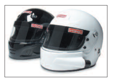
Racing Helmets See pages 3 – 9