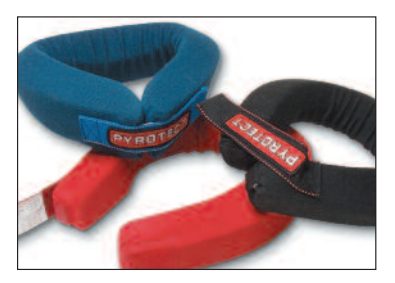
Racing Accessories See pages 21 – 23