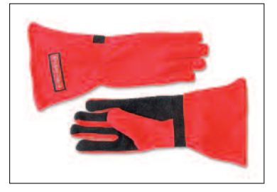
Protective Wear See pages 16 – 17