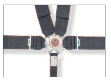
Harness Systems See pages 18 – 20